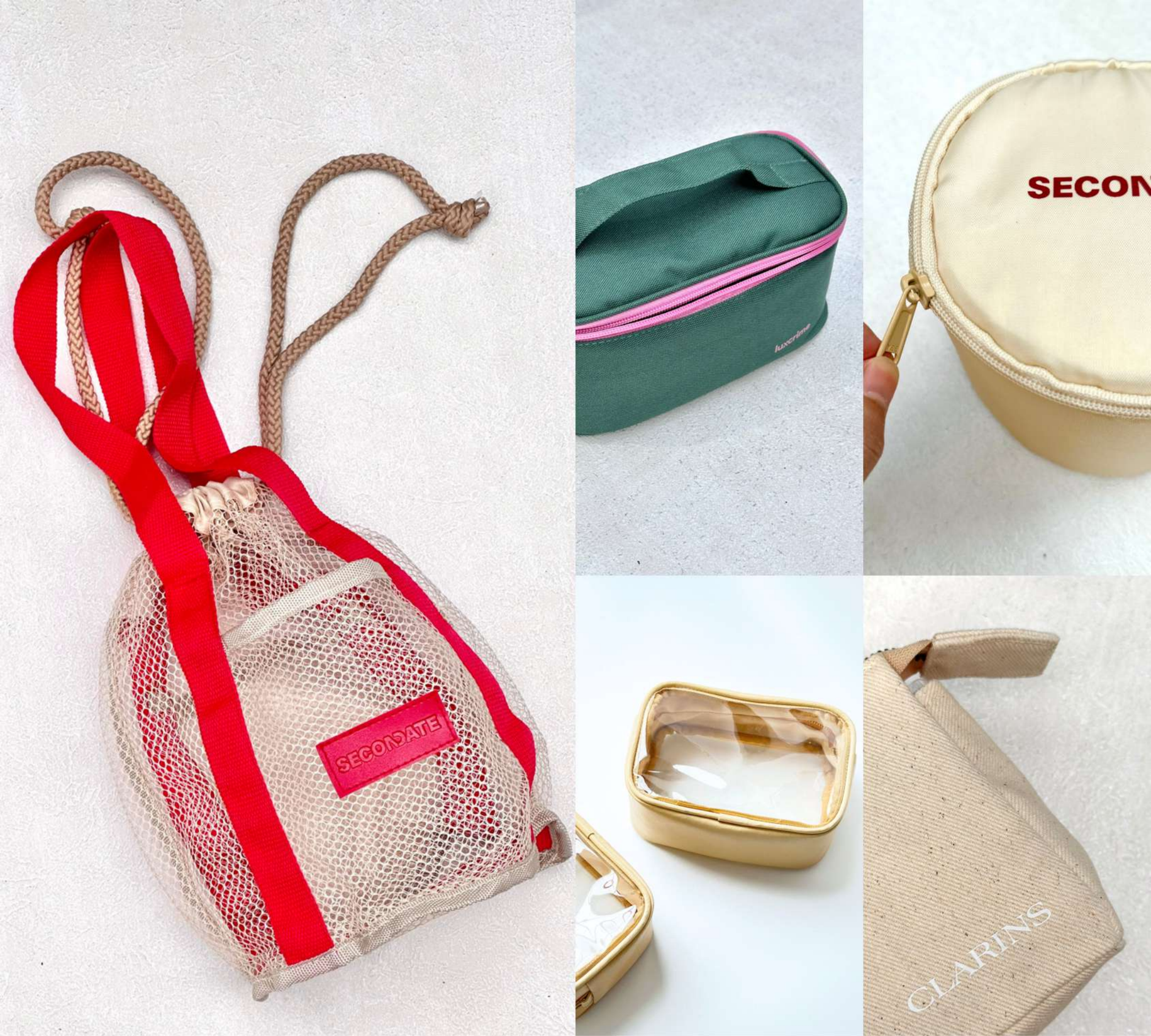
Custom makeup pouches—designed for the modern woman on the go.